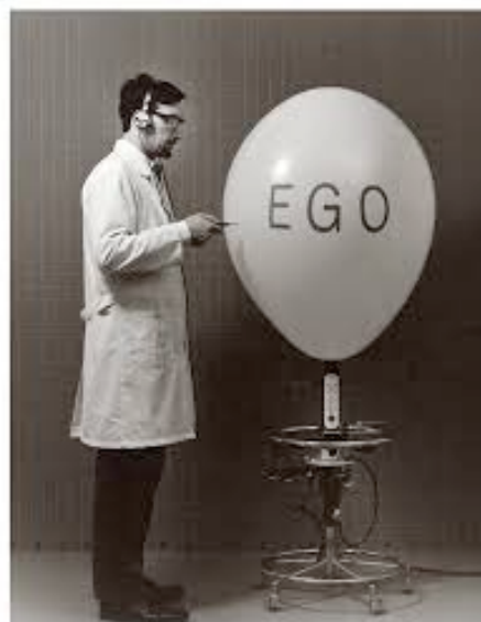
(far right) “In a Cage” David Shrigley