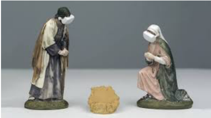
“Searching for God” Frederico Clapis

Are you bored yet? Below are some artistic conversation starters: